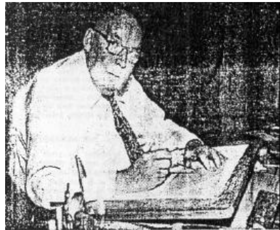
Demonstrating to the reporter how to square a circle, a secret of the old cathedral builders.