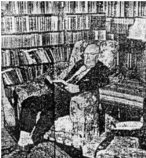
Relaxing in his home with some of his 4000 books