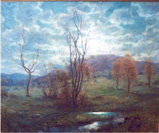
Early Moon Rise